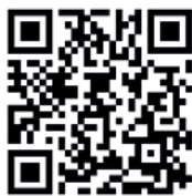
Watch the demo.

SGG BIOCLEAN® acts 100% naturally by exploiting the dual action of daylight and rainwater.